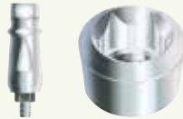
FMSM supplied with implant

Ø 3.8 mm Implant Platform SPMB Series (Internal Hex)