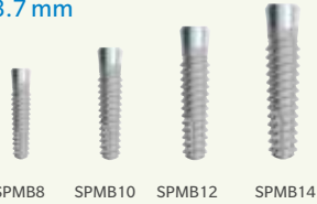
SPMB8 SPMB10 SPMB12 SPMB14