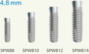
SPWB8 SPWB10 SPWB12 SPWB14