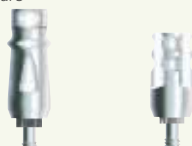
FMSM supplied with implant SPMT