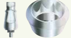
FMSW supplied with implant

Ø 4.8 mm Implant Platform SPWB & OPWB Series (Internal Octagon)