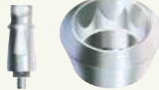
FMS supplied with implant

Ø 4.8 mm Implant Platform SPB & OPB Series (Internal Octagon)