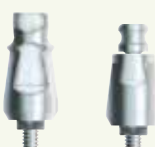
FMSW OPA/6 (supplied with implant)

Ø 4.8 mm Implant Platform Ø 6.0 mm Flare