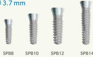
SPB8 SPB10 SPB12 SPB14