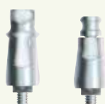
FMS OPA/5 (supplied with implant)

Ø 4.8 mm Implant Platform Ø 6.0 mm Flare