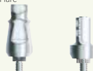
FMSW supplied with implant OPT/6

Direct Transfer (optional procedure for Open Tray Impressions, Transfer supplied with Implant, screw sold separately)