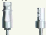
FMS supplied with implant OPT/5