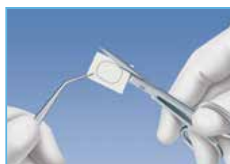
3. Membrane cut for placement.