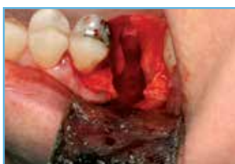
1. Exposed buccal wall defect on #3.