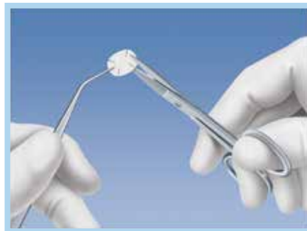
BioMend Membrane being prepared for placement in the sinus cavity

A rigid enough scaffold for tissue regeneration in GTR and GBR procedures