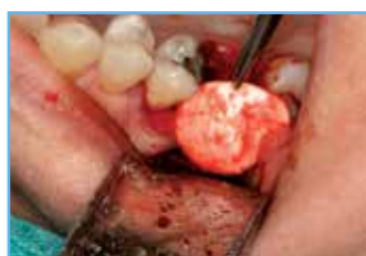
2. Membrane being prepared for placement.