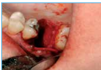
4. Membrane placed in socket.