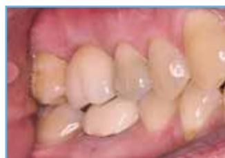
6. Final aesthetic result.

Individual results may vary. 1 Data on file with Collagen Matrix, Inc.