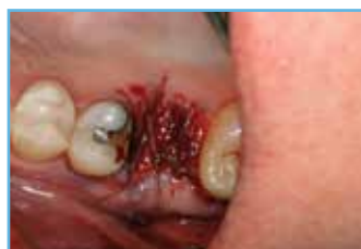
5. Sutures placed to close site.