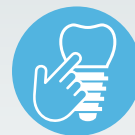
ZIPATHWAYZ ® PROGRAMS