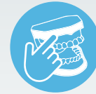
ZI IMPLANT SKILLZ ® SERIES