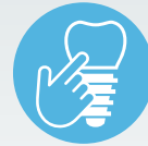
ZIPATHWAYZ ® PROGRAMS