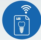
ZI LIVE CASE PRESENTATIONS