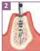
SV2.3D 2.3mmD Drill