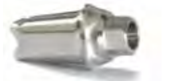
Hex-Lock™ Contour Abutment