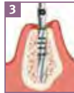
SV2.8D 2.8mmD Drill