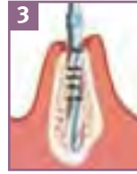
ZOP28D 2.8mm/2.4mmD Drill