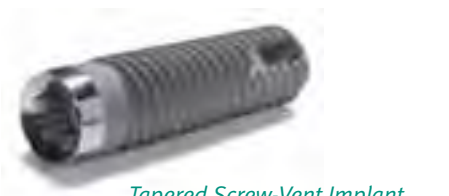
Tapered Screw-Vent Implant