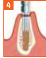
OPTIONAL FOR DENSE BONE ZOPTT30 3.0mmD Cortical Bone Tap