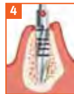
FOR DENSE BONE TSV4D 4.4mm/3.8mmD Drill