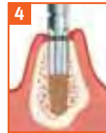
OPTIONAL FOR DENSE BONE ZOPTT37 3.7mmD Cortical Bone Tap