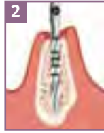
SV2.3D 2.3mmD Drill