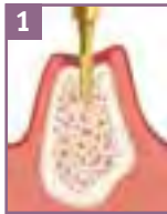
0201 2.1mm/1.6mmD Drill