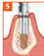
OPTIONAL FOR DENSE BONE ZOPTT47 4.7mmD Cortical Bone Tap

Note: In most cases, short drills with an overall length of 11mm are available for placement of 10mL Zimmer One-Piece Implants in jaw locations with limited vertical access. See product catalog for a complete listing.