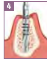
TSV3D 3.4mm/2.8mmD Drill