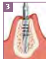
TSV3D 3.4mm/2.8mmD Drill