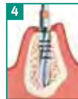
FOR SOFT BONE SV3.8D 3.8mmD Drill